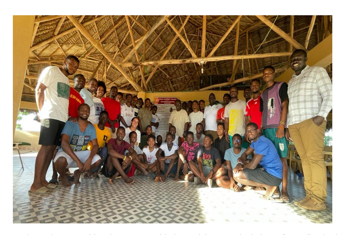
Group Photo when Launching the program with the participants and mission safeguarding leaders

Participants expressed a deeper understanding and commitment to safeguarding principles following the training. They reported feeling more equipped to recognize signs of abuse or neglect and confident in their ability to respond effectively. The training fostered a sense of responsibility and accountability among participants towards protecting the vulnerable populations they serve. The team was also assessed based on their participation and written test, and the results were satisfactory. The pictures below remain a testimony of the work done during training.