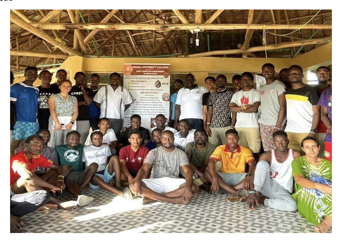
Group photo after class session