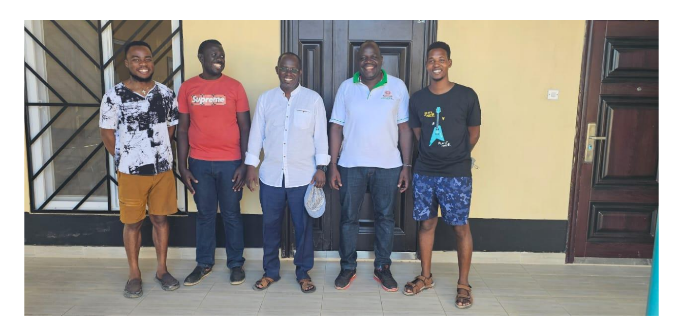
Touring the mission facilities